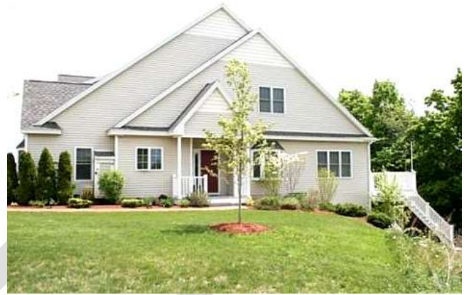
View of one of the 15 condominium buildings at Danvers State Hospital