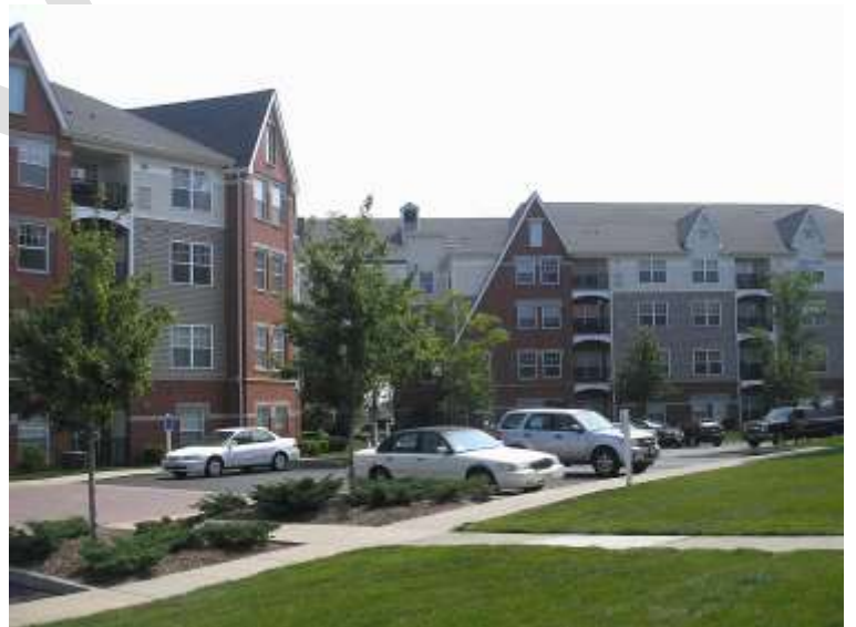
497 1, 2, and 3 bedroom apartments at Avalon Danvers