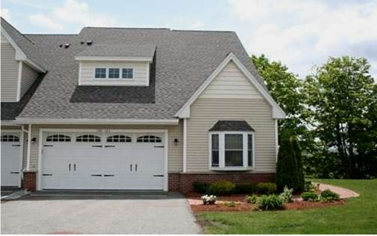
Entrance of one of the condominiums.