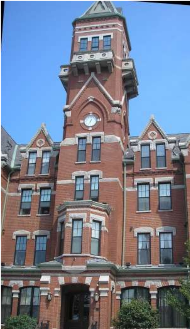
Restored Kirkbride Building at Danvers State Hospital