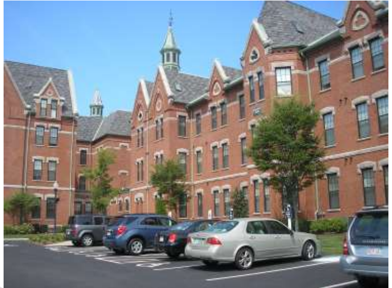
Restored buildings in inner court of Avalon Danvers