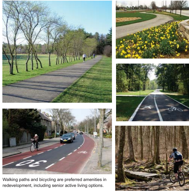
Walking paths and bicycling are preferred amenities in redevelopment, including senior active living options.

Self-driving vehicles will soon be commonplace. Olli, as shown above, is a self-driven, electric shuttle, ideal for campus and downtown settings. 3D-printed by Local Motors, Olli could move people around the MSH campus, and between locations in Medfield.