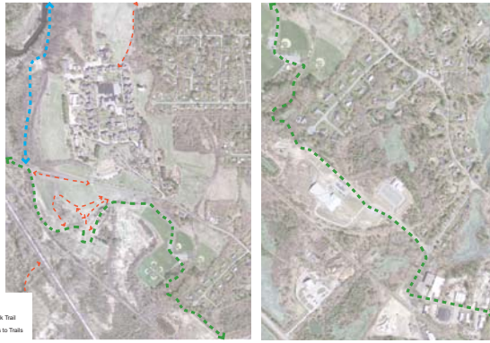
Legend Bay Circuit Trail Charles River Link Trail Other Local Links to Trails