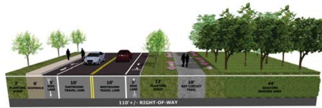
Lot 3 Cross-section