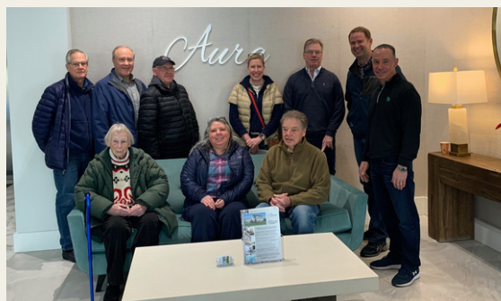
Town Boards and staff toured Aura the new 56 unit rental apartment in Medfield