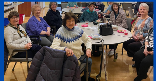
The Center celebrating its 15 year anniversary