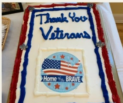
The COA hosted a luncheon for Veterans on Nov 10