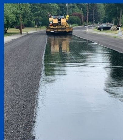
Rubber Chip Seal